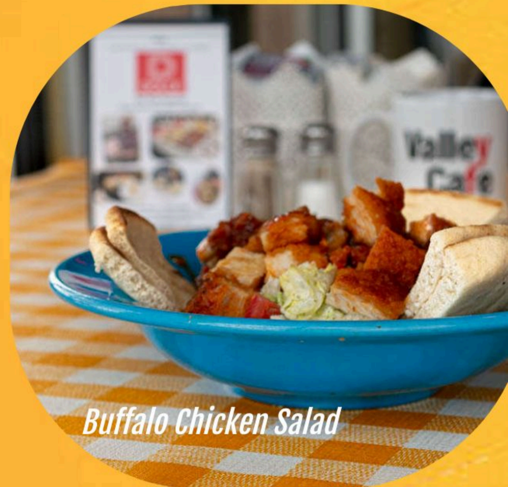
Buffalo Chicken Salad

Gyro Salad Plate 11.99 Gyro meat grilled and served on lettuce mix w/ tomato, red onions and hand tossed in our homemade gyro sauce.