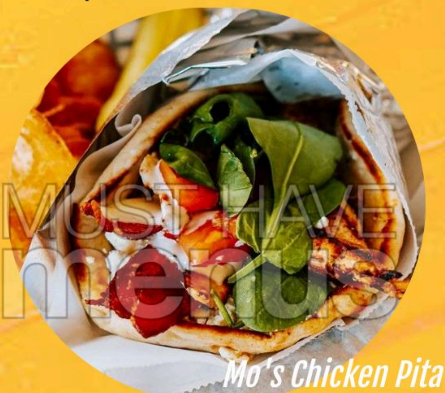
Mo's Chicken Pita